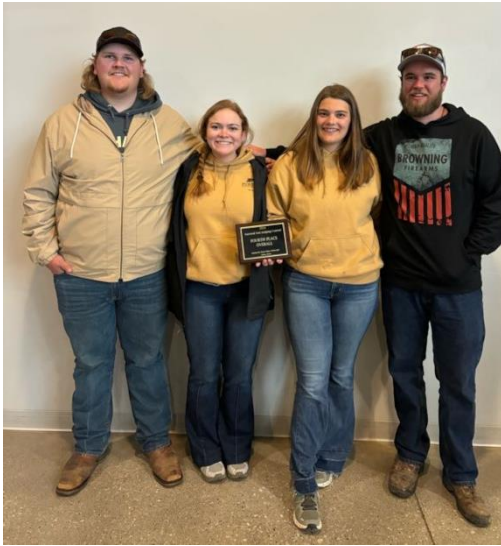
Pictured Left: Purdue University finished 4 th overall team at the 2024 National Collegiate Soils Contest in Ames, Iowa this Spring

Indiana is home to three collegiate soil judging teams: Purdue University, Ball State University, and Vincennes University. The teams regularly compete in both Fall Regional Competitions and often, when qualify, in Spring ASA National Competitions and NACTA Competitions. In the hope to continue to foster new soil science professionals, these teams and students need support. If you or your organization is willing to contribute to any or all of these teams financially please contact one of the officers of the IAPSC to find out how to donate.