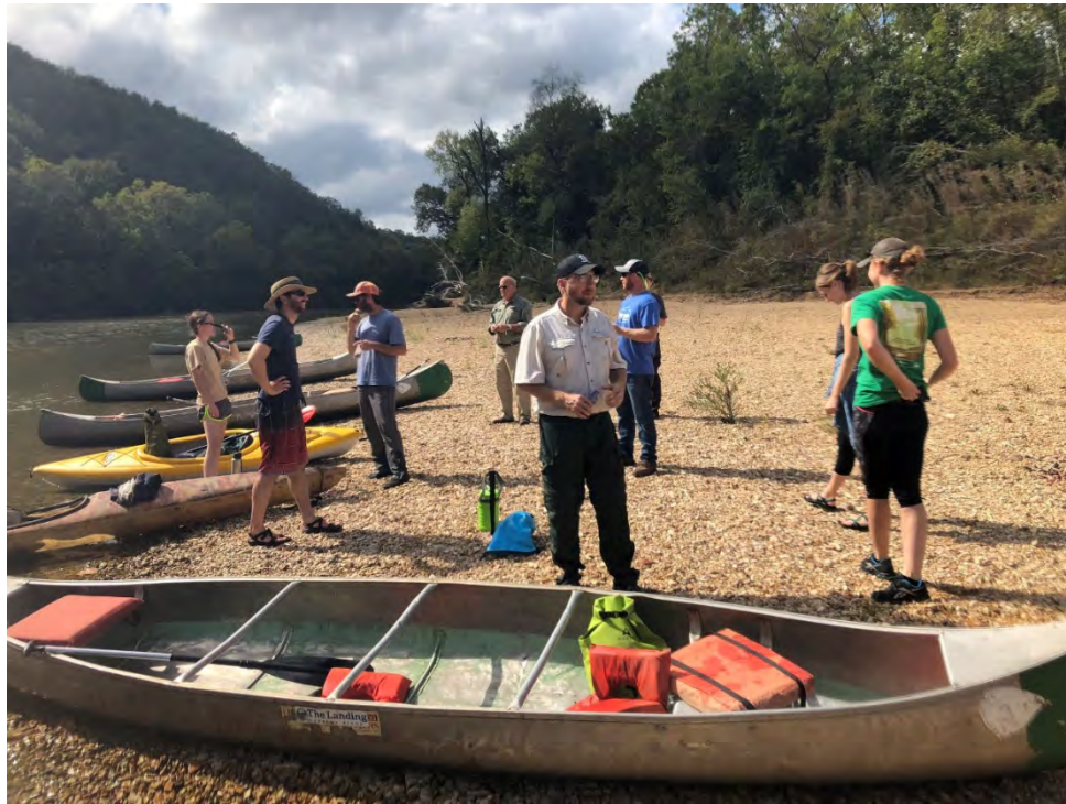
Some participants started out the Workshop with a canoe trip in the morning.