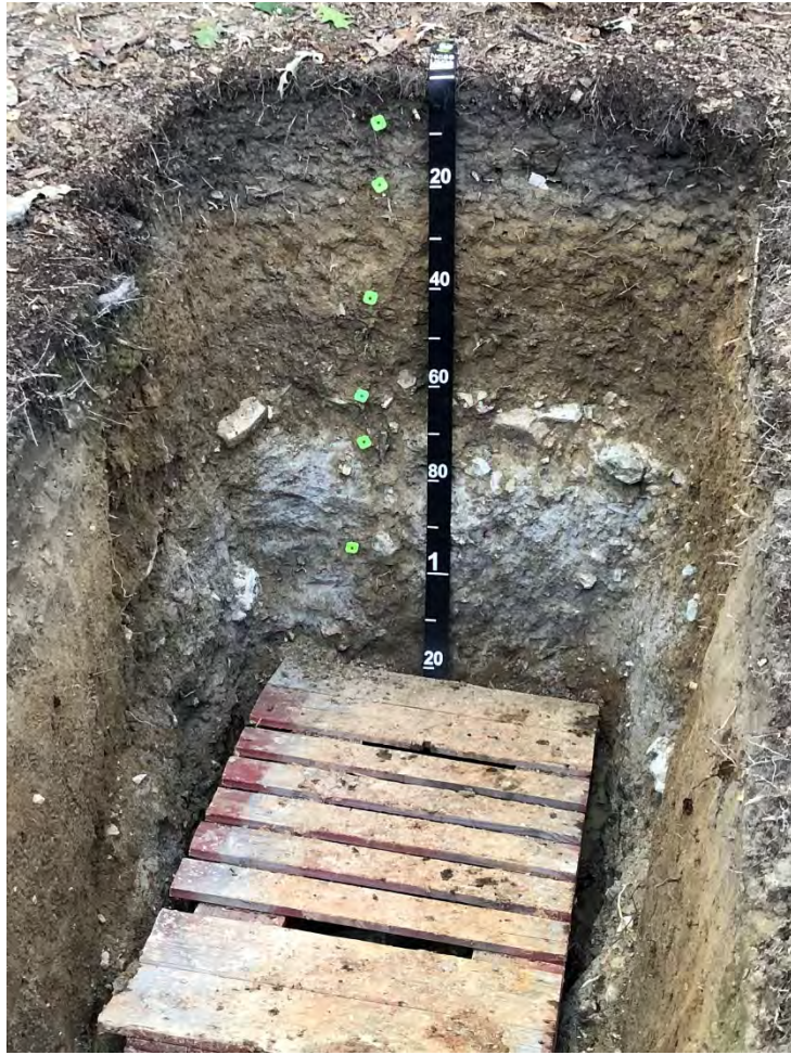
An empty pit just waiting for you!