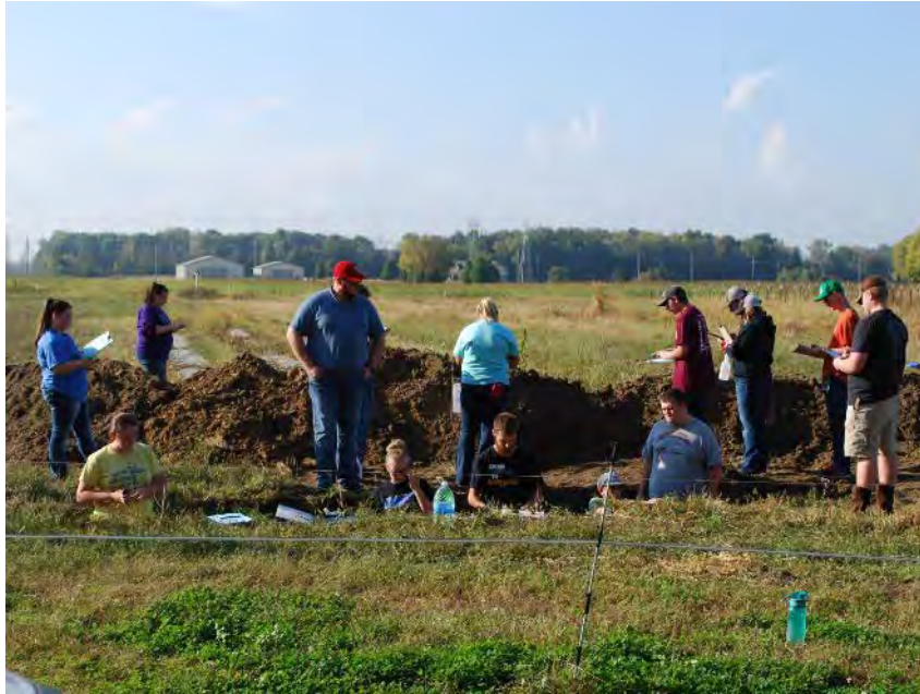
Students judging one of the four pits at a contest in Hamilton County, Indiana.

The contests concluded with discussions and reviews of each site, providing students an opportunity to ask questions, and for the judging officials to explain the reasoning for describing and interpreting the soils in the way they did.